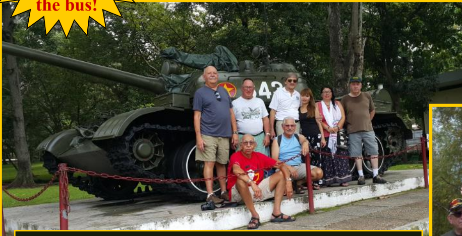
Above: Touring Saigon. Right: GEN Peter Pace, USMC former CJCS shows where it went down. Below: Vietnam will be in a happy Christmas mood.